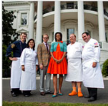
The Secret Ingredient Is Politics