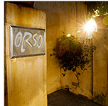
An End to Hollywood Power Lunches at Orso