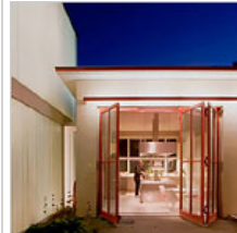
In Berlin, a Renovated Gas Station